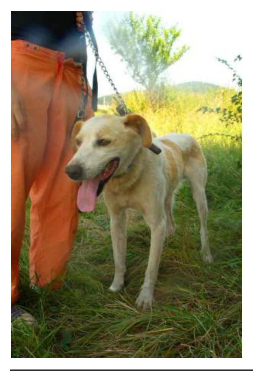
9. Name: Hardi – could be adopted in home without other dogs Birth date: 2005 Weight: 25 – 26 kg Sex: Female

He is very nice with people but he doesn't get on with other male dogs. Because of this he lives on a chain. He is playful dog and the life on chain doesn't reflect well on him. He would be the perfect pet in home without other male dogs.